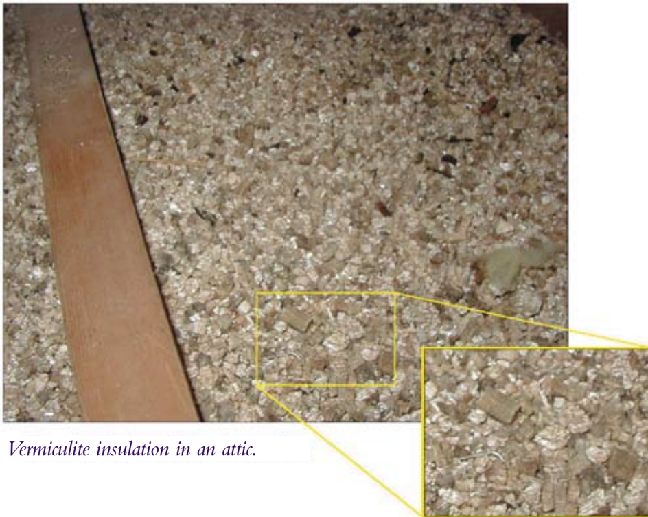
Vermiculite insulation in an attic.

V ermiculite insulation was installed as ceiling and wall insulation in hundreds of thousands of Canadian homes, offices, banks and other buildings. Much of this material is contaminated with potentially dangerous asbestos fibres. Homeowners and property managers need to put careful controls in place to prevent disturbance of the insulation. Careful removal should precede any significant disturbance, for example, prior to renovations. Those involved in property assessments and transfers (building inspectors, real estate agents and brokers, lawyers, mortgagors) should warn the prospective purchaser of the presence of vermiculite insulation and consider its impact on property value.